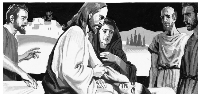
"The dead man sat up and began to speak."