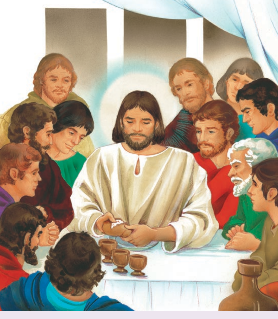
At the Last Supper Jesus gave us the First Eucharist.