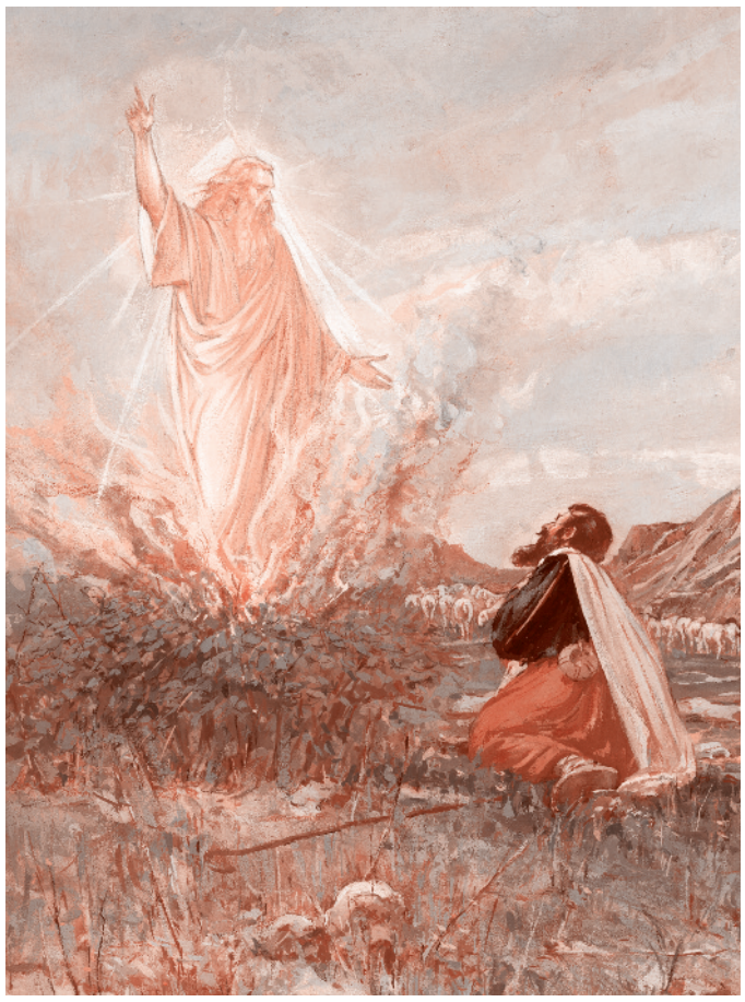
MOSES — POWERFUL EXEMPLAR OF PRAYER

The prayer life of the Israelites was typified by leaders such as Moses. By communing with God in the burning bush and on the holy mountain (for forty days and nights), he set an example of how the individual Israelites should pray to God.