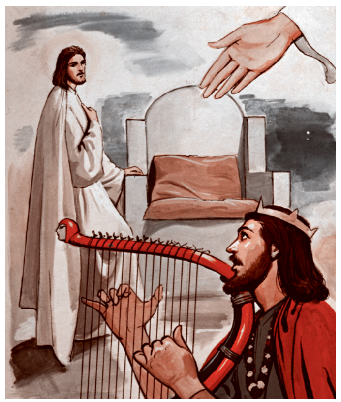
THE PSALMS — PRAYERBOOK OF THE HOLY SPIRIT

The Psalms may be looked upon as the prayerbook of the Holy Spirit. Over the long centuries of Israel's existence, the Spirit of God inspired the psalmists (typified by David) to compose magnificent prayers and hymns for every religious desire and need, mood and feeling. Thus, the psalms have great power to raise minds to God, to inspire devotion, to evoke gratitude in favorable times, and to bring consolation and strength in times of trial.